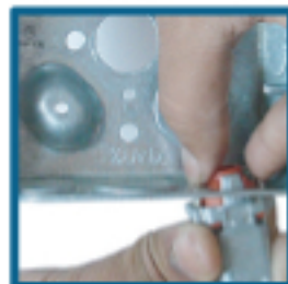
EZ no tool removal