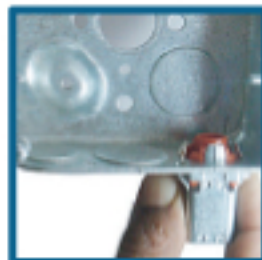
Snap into box