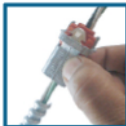
Snap in cable